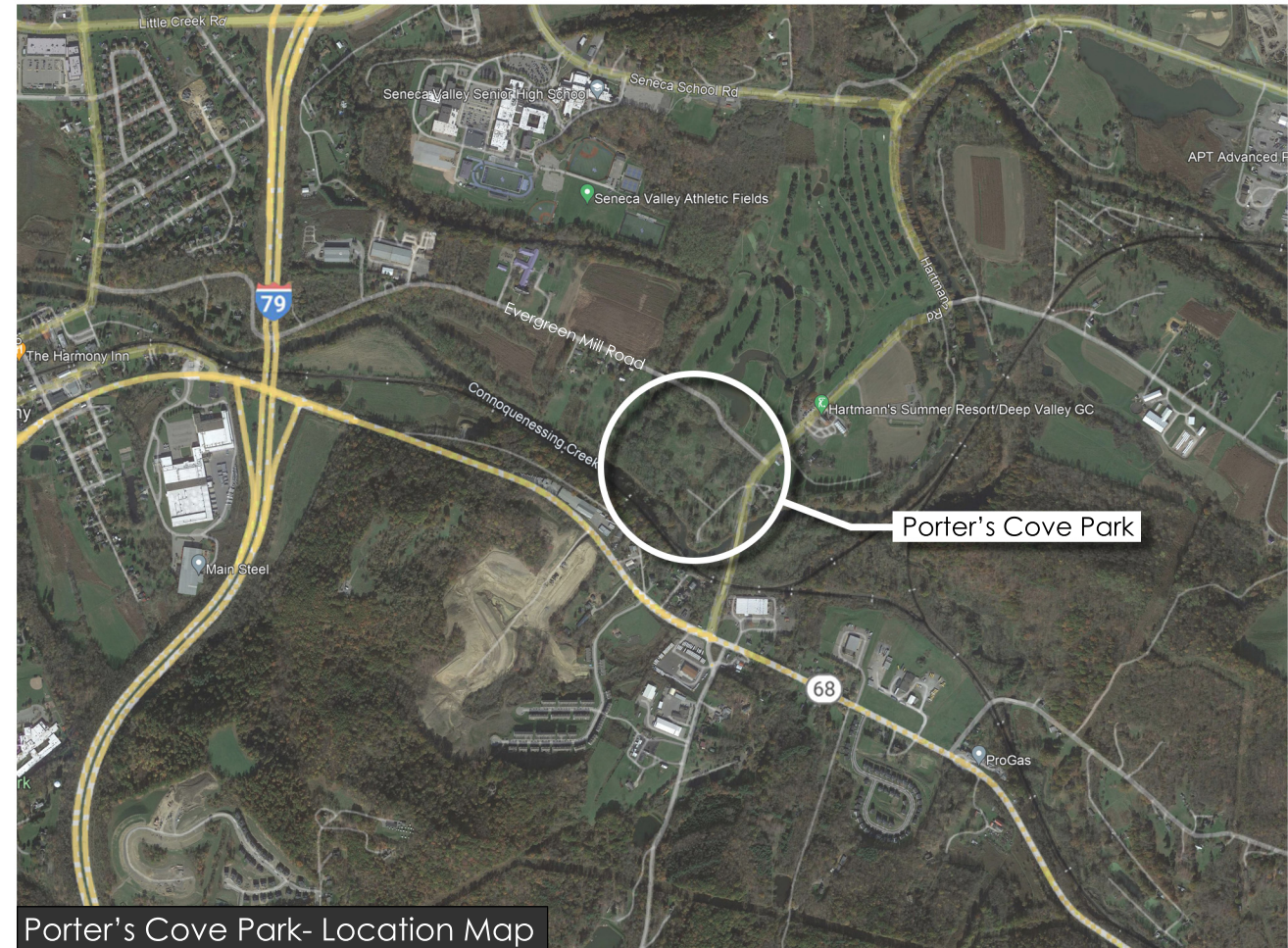
Porter's Cove Park- Location Map

Porter's Cove Park | Dog Park Jackson Township Butler County, Pennsylvania